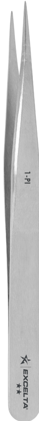
Critical Tip Measurements (Tip Width and Thickness of one point)